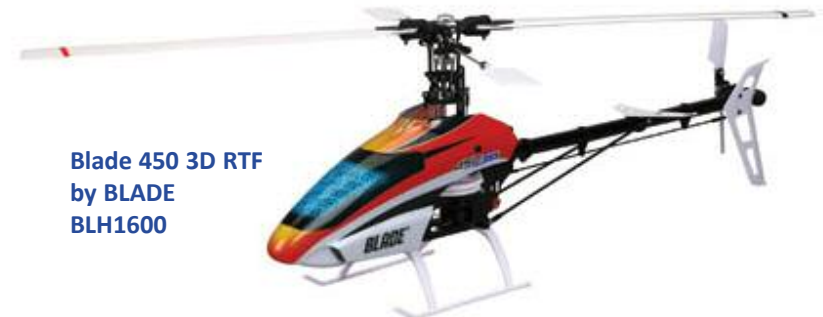
Blade 450 3D RTF by BLADE BLH1600

The Flypaper is looking for photos of your latest project(s) for these pages. We all work very hard building and assembling our aircraft—why not show us the fruits of your labor? If you have something you would like to share, please send an e-mail with photos to newsletter@foxvalleyaero.com