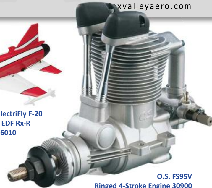
O.S. FS95V Ringed 4-Stroke Engine 30900