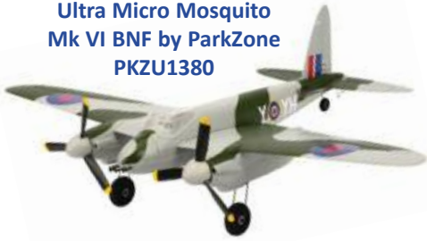
Ultra Micro Mosquito Mk VI BNF by ParkZone PKZU1380