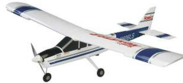
Hobbico NexSTAR Select Brushless Trainer RTF 68.5" HCAA09**

Cell: 630-373-2722 mkostecki503@comcast.net