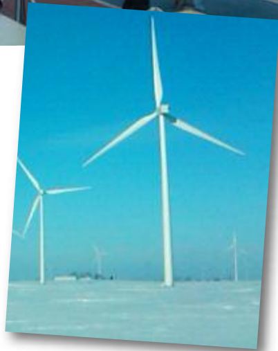
I saw possible propulsion for Merlyn's next multi-engine project.