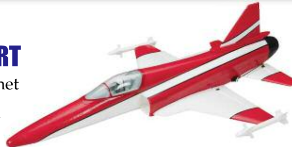
Great Planes ElectriFly F-20 Tiger shark EDF Rx-R GPMA6010