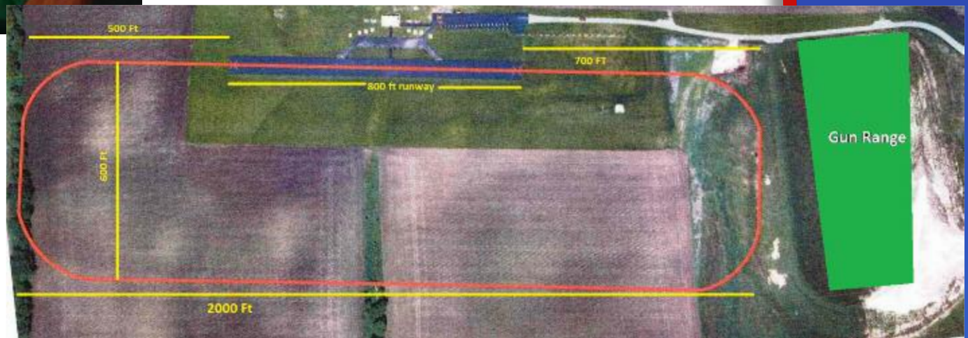
Fox Valley Aero Club Flight Pattern

We will continue to communicate with the St. Charles city officials regarding the upcoming flying season. Please share with me any questions or concerns that you may have—I will get the answers.